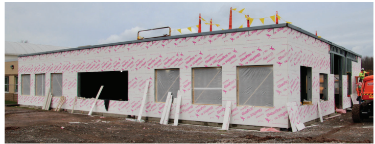
Construction of OWL Middle School.

of a second-floor room into two new staff bathrooms. The orchestra room also received a new drop ceiling that seamlessly integrated the existing sound panels.