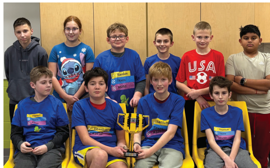
The Titanium Titans