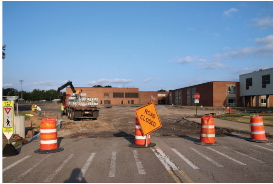
The Webster Schroeder south parking lot under restoration.

For more photos, detailed updates, and additional information about the Approved Capital Improvement Project 2023, be sure to visit the district website at www.websterschools.org/capitalproject .