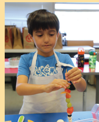
At left, a camper learns to make tasty and healthy treats at the Little Chefs Camp.

If you've misplaced your copy of the Webster Community Education Fall Program Guide , fear not! Just go online to websterschools.org/communityed and enroll today!