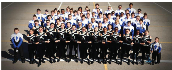
The state championship Webster Marching Band!

To learn more about Webster Marching Band or any of its groups, visit their website at webstermarchingband.webs.com .