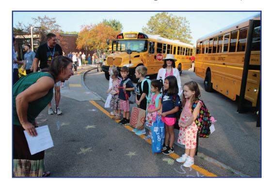
Bus Loops, Parking Lots & Sidewalks

Reconstruction or renovation of bus loops, parking lots, or sidewalks at several of our schools will improve safety of traffic flow.