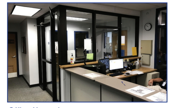
Office Upgrades The existing main office at Webster Thomas HS will receive security upgrades.